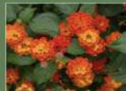
Texas Red Lantana Gold lantana is also an option