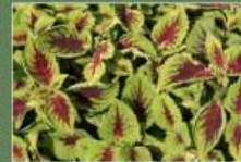
Coleus Many leaf patterns and colors