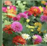
Zinnia Can be started from seeds