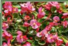
Begonias Variety of flower and leaf colors