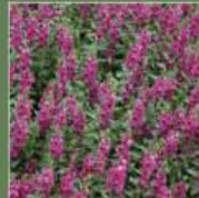
Angelonia Comes in many colors