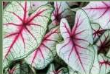
Caladiums Vein colors add interest to this leafy plant