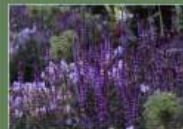
Salvia Many colors, varieties, & sizes