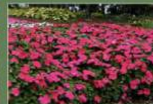
Impatiens Provide prolific blooms in shade