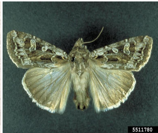
Army cutworm moth.