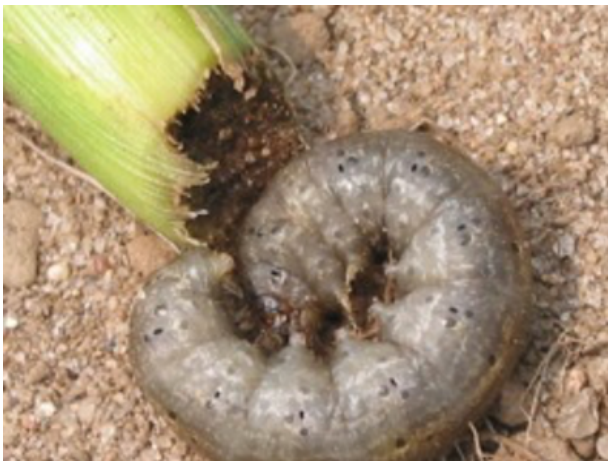
"C" shaped army cutworm larva

There has been a significant rise in cutworm activity all over Texas recently, with many species inhabiting Texas landscapes from May to September. In one season, up to five generations of cutworms can be present in Texas, and this year, they are getting an early start. The life cycle of a cutworm typically involves egg-laying, hatching, several larval stages, pupation, and finally, emergence as an adult moth.