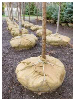
B & B Tree